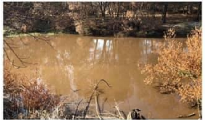
The Nariel Creek just after the bushfires