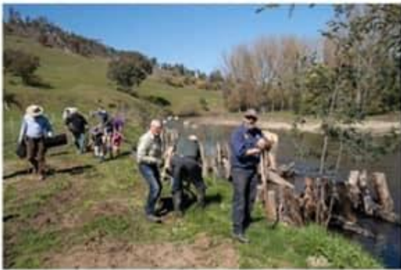
Planting Day at Nariel 2019