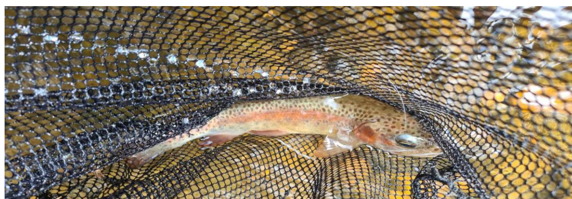
Craig's 2 Trout caught on the Taggerty River With Pheasant Tail Nymphs.